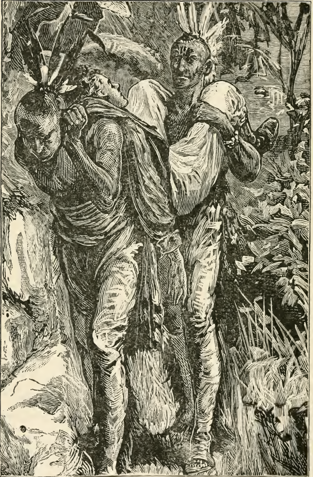
THEY STALKED AWAY WITH HIM.—PAGE 125.